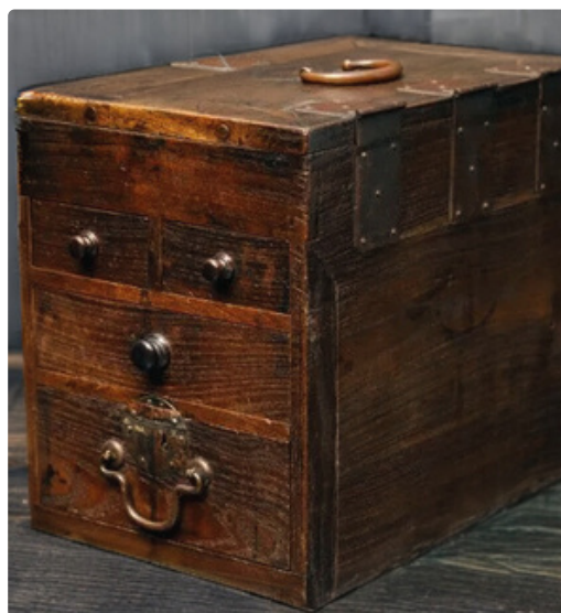
Antique Japanese Smiling Ink – Stone Box € 340

Dimensions: H 105cm, W 89cm, D 46cm Period: Meiji (1868-1912) / Taisho (1912-1926) Material: Zelkova serrata /Cryptomeria japonica Product no.: D23015