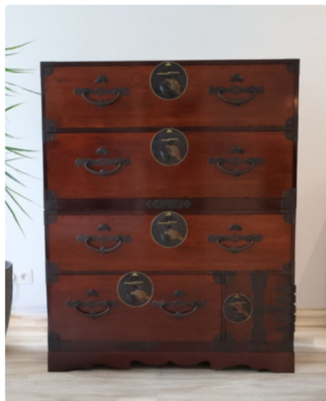
'Fuji (富士) Isho Tansu (衣装箆笥)' – Antique Japanese Chest € 2.480

Dimensions: H 162 cm, W 90 cm, D 41 cm Period: Meiji (1868-1912) / Taisho (1912-1926) Material: Cryptomeria Product no.: D23086