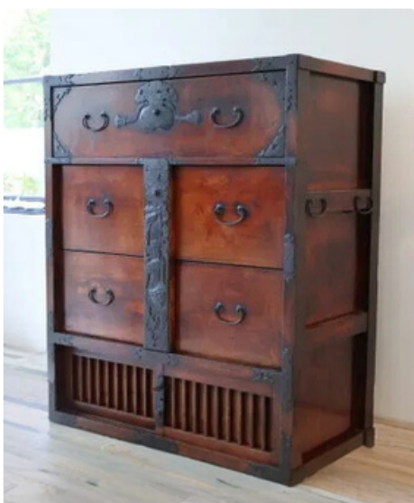
'Kinchaku (巾着) Ishou Tansu (衣装箆笥)' – Antique Japanese Costume Chest € 2.480

Dimensions: H 129cm, W 104cm, D 46cm Period : Meiji (1868-1912) / Taisho (1912-1926) Material: Zelkova serrata /Cryptomeria japonica Product no.: D23016