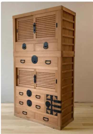
Tall 'Choba Tansu (帳場箆笥)' – Antique Japanese Cabinet € 2.980

Dimensions: H 162 cm, W 90 cm, D 41 cm Period: Meiji (1868-1912) / Taisho (1912-1926) Material: Cryptomeria Product no.: D23086